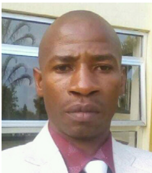
Prime Nkezumukama Eastern Africa Regional Representative